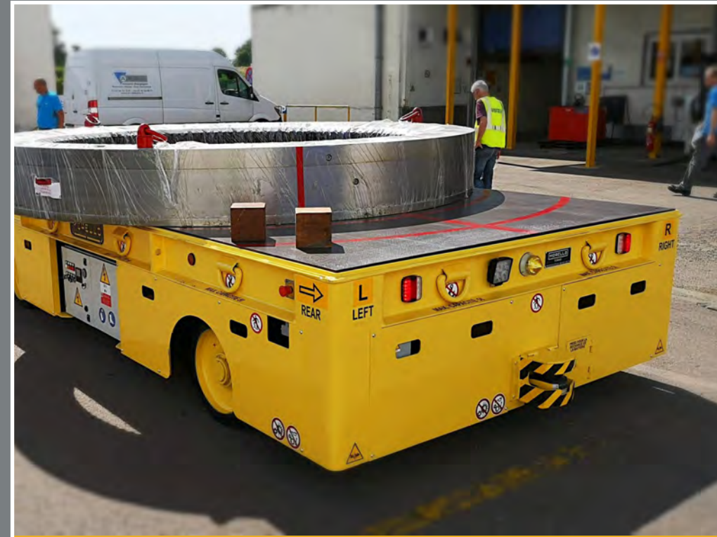
WHEEL BASED BATTERY/ELECTRIC FLATBED TROLLEYS