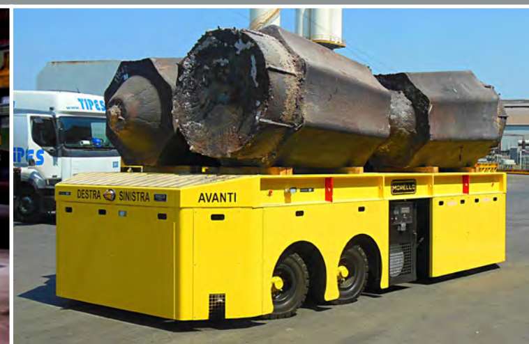
DIESEL POWERED TROLLEYS