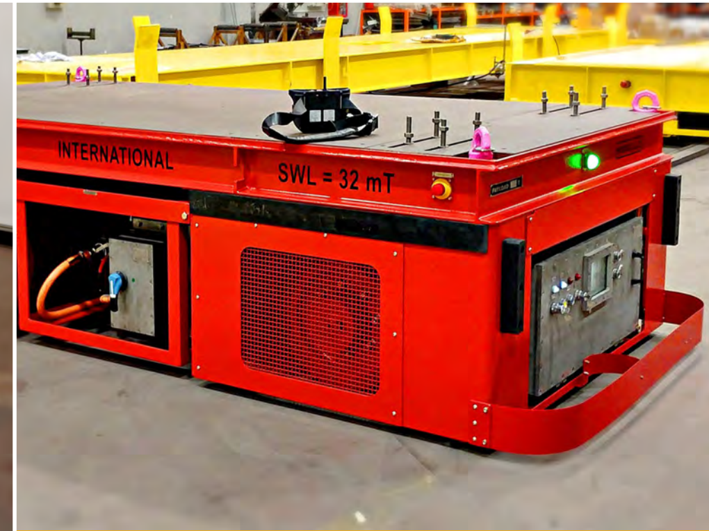
TROLLEYS FOR HAZARDOUS ENVIRONMENT (EX)