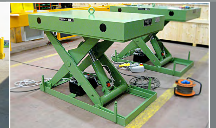
OTHER HANDLING EQUIPMENT