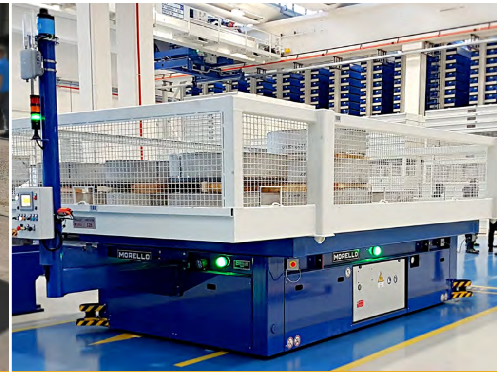
AGV / AUTOMATED GUIDED CARTS