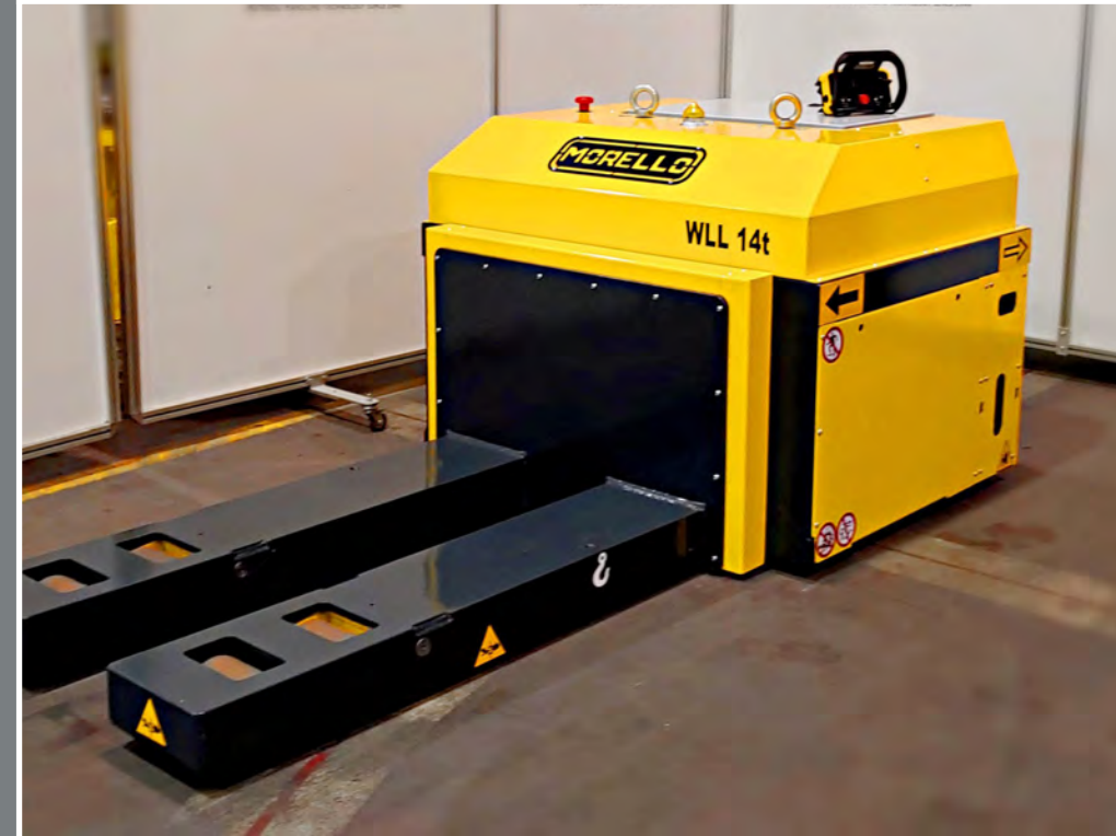
ELECTRIC HEAVY DUTY TRANSPALLETS