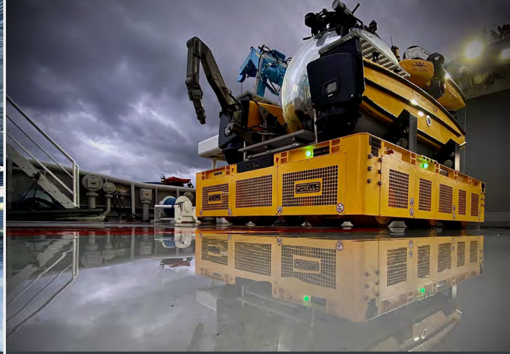
NAVAL AND SHIPYARDS