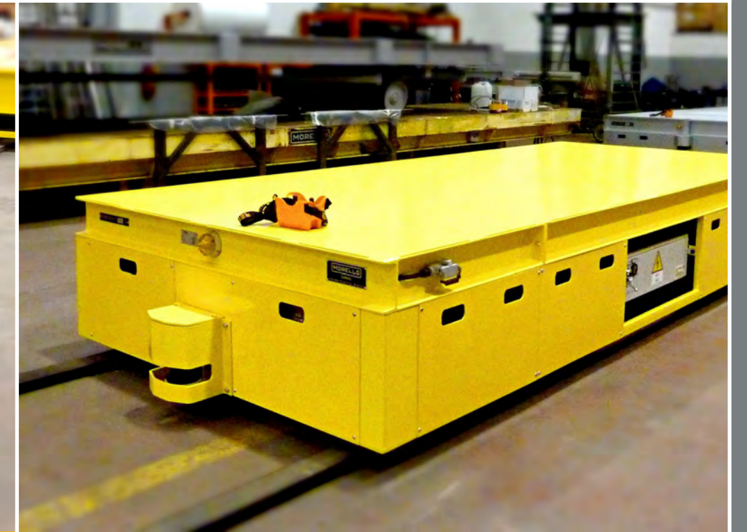
RAIL GUIDED TROLLEYS MANUAL AND AUTOMATIC